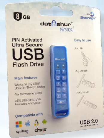
datAshur Personal in retail packaging